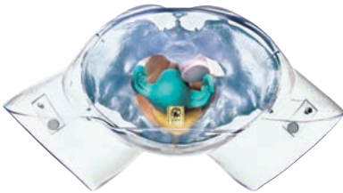
top-view of the model, closed

This model has been produced in co-operation with biologists, sex educationalists, sex therapists, sexual researchers, gynaecologists and urologists.